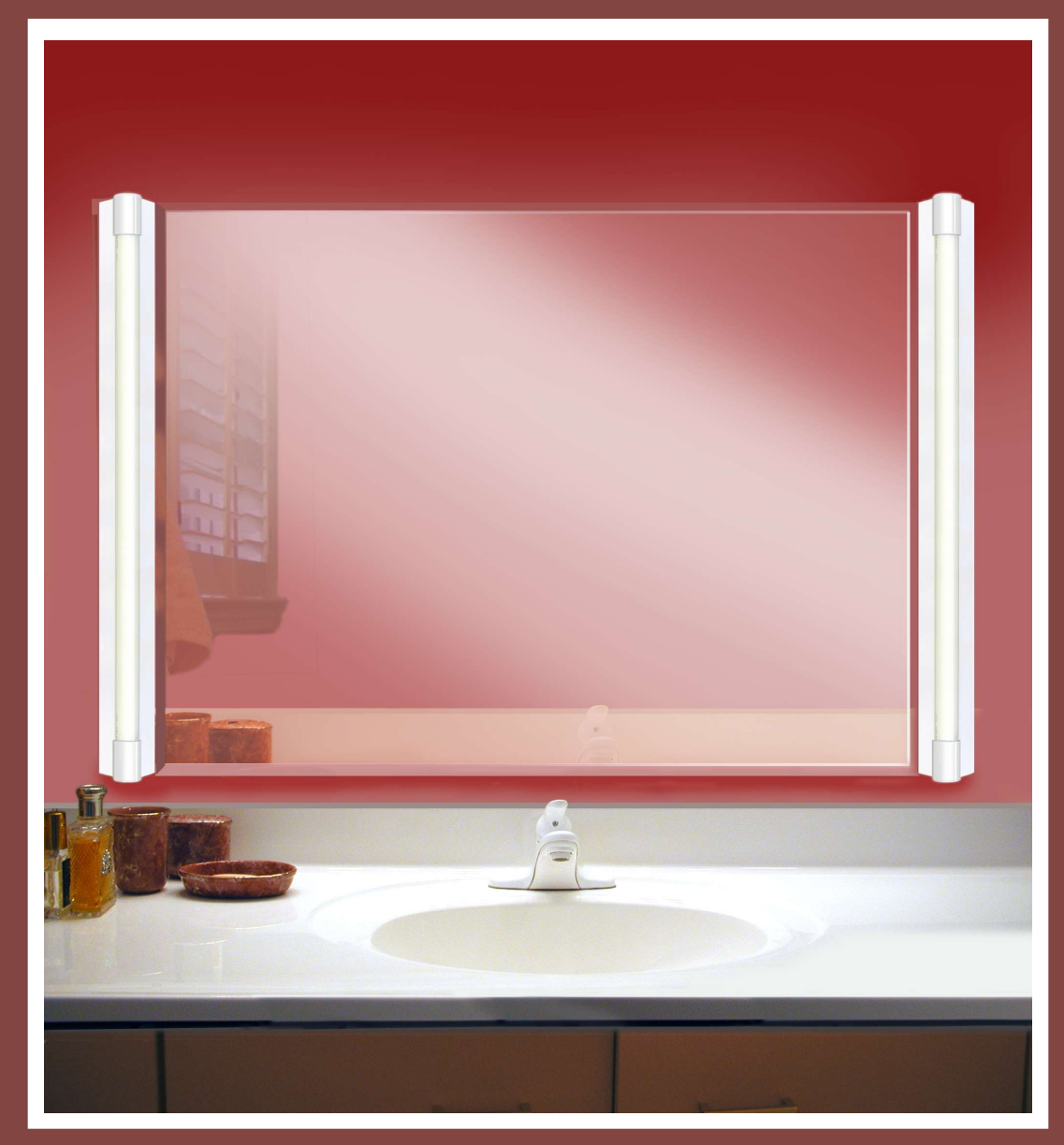
Decorative Linear Fluorescents